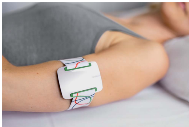
Figure 1 Multimodal sensor

The Nightwatch bracelet contains a photoplethysmographic heart rate module and a 3-dimensional accelerometer. The position on the upper arm was preferred to the wrist because of better signal quality and fewer movement artifacts. The signals or alarms are transmitted by DECT ultralow energy (DECT ULE) directly to the base, which may be connected to a local area network for further transmission of the data and alarms. DECT-ULE is a wireless communication standard with a greater range, reliability, and safety than Bluetooth or Wifi. Figure published with permission from Livassured.